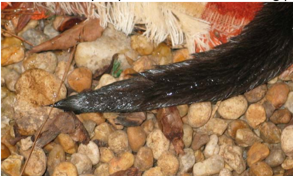
Tail tip after being self nursed on.