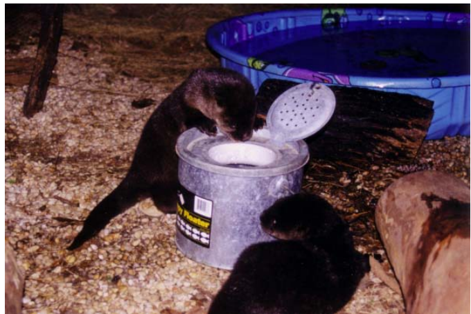
Novel way to introduce live prey.