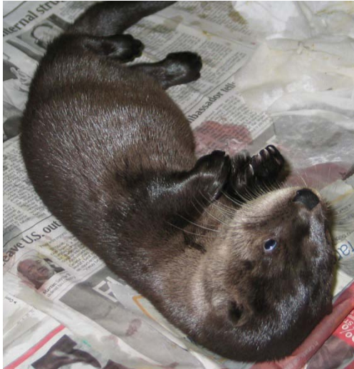
Healthy well fed baby river otter