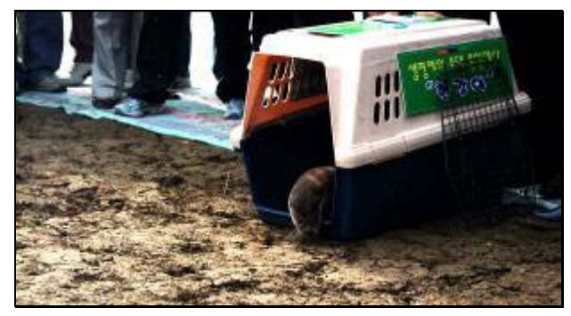
The released otter, Han-gang-ee