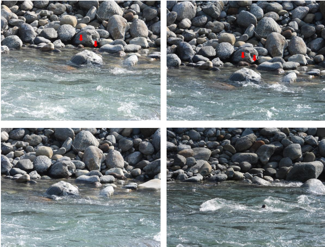
Figure 2. Two Asian Small-clawed Otters ( Aonyx cinereus ) seen foraging in and amongst the boulders on the banks of the Namdapha River, Arunachal Pradesh, India – eventually swimming downstream and joining the other two otters.