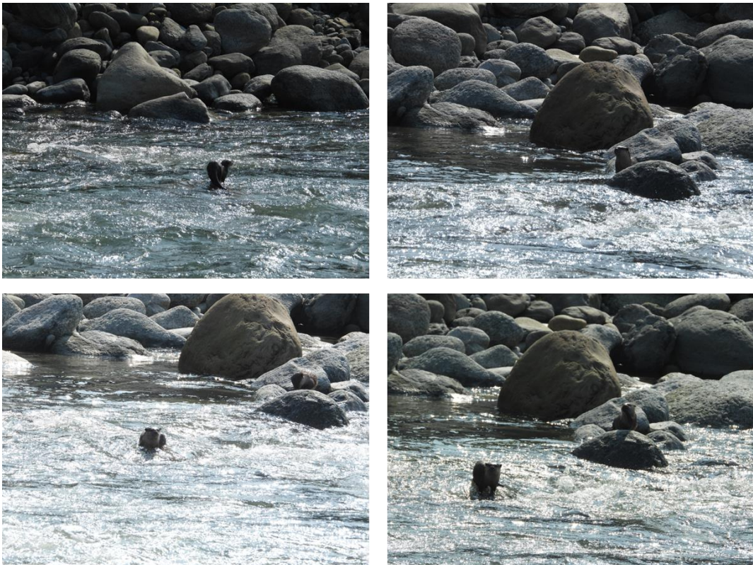
Figure 3. Two Asian Small-clawed Otters ( Aonyx cinereus ) seen on the rocks (exposed and submerged) between dives for fish and to rest after swimming in the rapids.